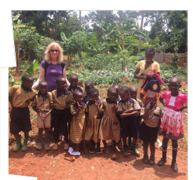
EDUCATING THE NEXT GENERATION