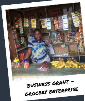
BUSINESS GRANT - GROCERY ENTERPRISE