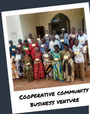
COOPERATIVE COMMUNITY BUSINESS VENTURE