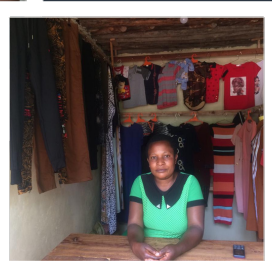
BUSINESS GRANT - CLOTHING ENTERPRISE