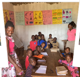
EDUCATING THE NEXT GENERATION