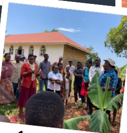
ORGANIC FARMING INITIATIVE