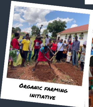
ORGANIC FARMING INITIATIVE