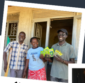
ORGANIC FARMING INITIATIVES