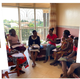
BUSINESS GRANT - TRAINING DAY